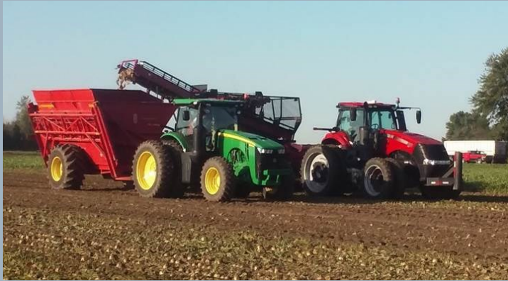
Sugar Beet Harvester picking beets in a farmers field.

Resources to address delayed planting concerns were provided and accessed by Bay County farmers. Meetings were held though out the Saginaw Valley region and supplemented with individual consultations and analysis tools for additional assistance. In addition, three farm families participated in the TelFarm financial analysis and benchmarking program, and received educational consultations for farm business planning.