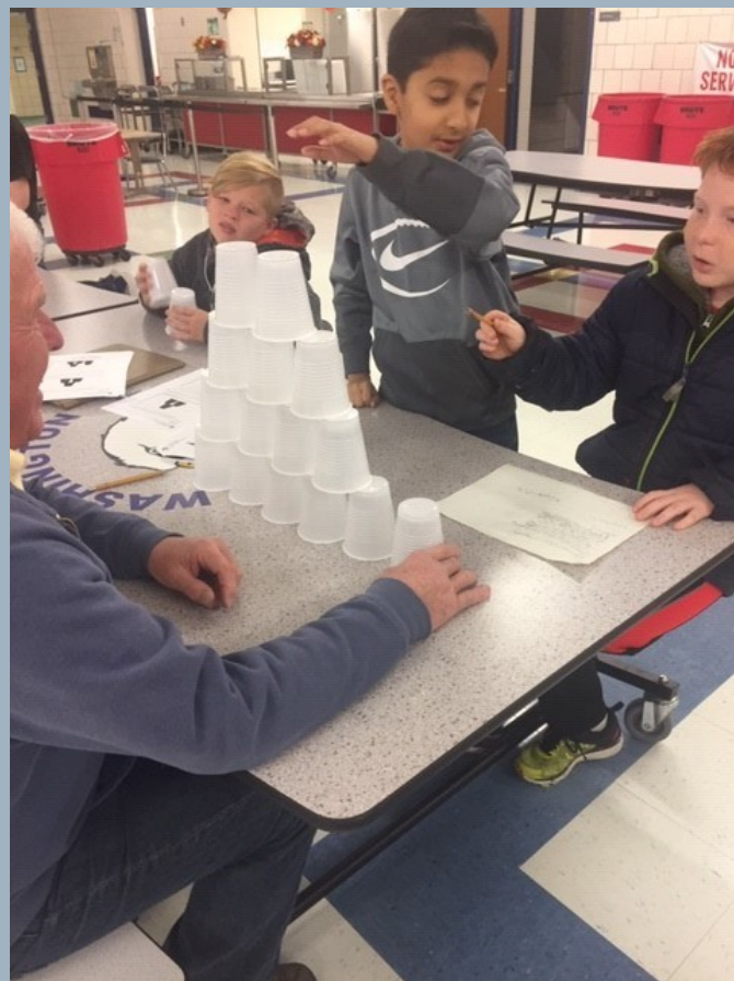
Learning how to code by stacking cups.