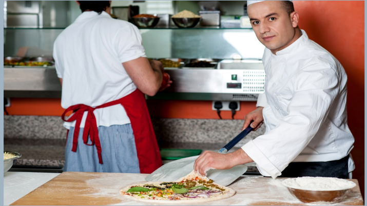
The ServSafe Certification program teaches about food-borne illnesses and how to prevent it.

MSU Extension Social Emotional health programming aims to promote health and wellbeing, including understanding important connections between physical, mental, social and emotional health. In 2019, 10 presentations were held in Bay County, reaching 297 adults and 30 youth. Topics and programs presented included: RELAX: Alternatives to Anger, Stress Less with Mindfulness, Mindfulness for Educators, and Mindfulness for Parents and Caregivers. Special presentations were also held with Families Against Narcotics-Bay Region, the Bay County Prevention Network, and the Bay-Arenac Intermediate School District.