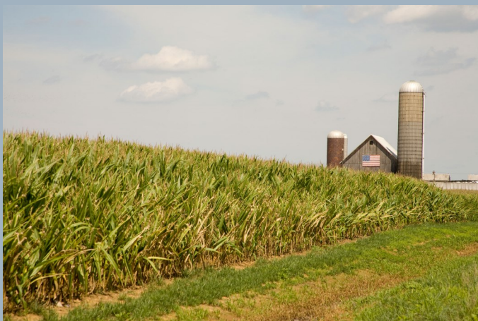
More than 50% of land in Bay County is used as farmland.