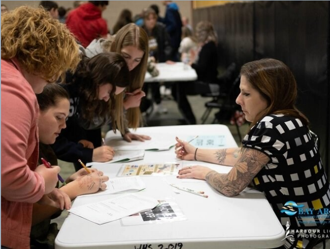
Western 9th graders making financial decisions and mistakes in a safe in environment participating in Mad City Money

The Bay City Bowman's Club continues to support the Bay County Shooting Stars Archery Club. Over 50 youth participated in the program. Three certified archery instructors provide leadership to the program. There were 10 youth who participated in the 4-H Archery State Shoot in August.