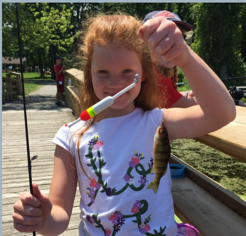
Every camper caught a fish at the camp.