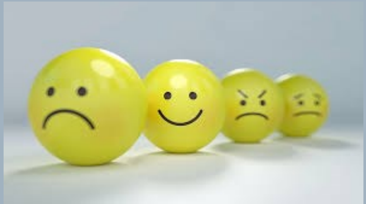
Mental health is important at every stage of life, from childhood and adolescence through adulthood